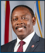
Orange County Mayor Jerry L. Demmings